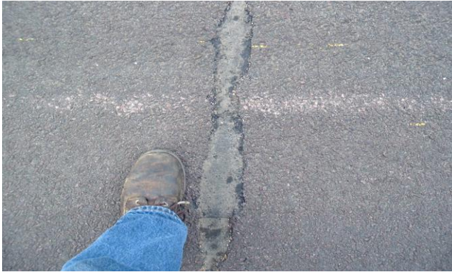
19 Photograph 3. Paving fabric maintains flexibility with joint expansion/contraction.

3 Photograph 3 shows an example of transverse thermal cracking at a joint, which resulted 4 in chip loss due to expansion at the joint. It is interesting to note that the paving fabric 5 maintained its integrity by being flexible with the expansion and contraction of the joint, and also 6 continued to perform as a waterproofing barrier.