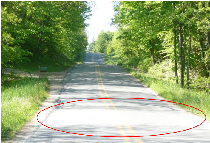
23 Photograph 4. Van Buren County Test Section 24 Fabric delaminated due to subsurface water pressure

6 Results: The Van Buren section performed the poorest with some chip loss in a low lying area 7 which appears to be saturated with ground water. The paving fabric delaminated due to exposure 8 to water from the subgrade (Photograph 4).