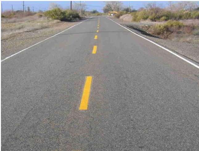
21 22 Photograph 1. Aerojet Facility, Northern California 23 20-Year Old Double-Chip Seal over Paving Fabric

12 13 14 Placing paving fabric prior to a single-chip seal has been a standard surface treatment practiced 15 by the County of San Diego for over 20 years (Dendurent, 2009). Northern California also 16 reports successful applications of placing fabric prior to a double-chip seal (Brown, 2003). 17 Research shows some fabric under chip seal projects in the United States have resulted in 18 maintenance-free pavements that received this application over 20 years ago, with little to no 19 reflective cracking (Dendurent, 2009). Photograph 1 reflects an example of a road that received 20 a chip seal over paving fabric with no subsequent road maintenance to date.